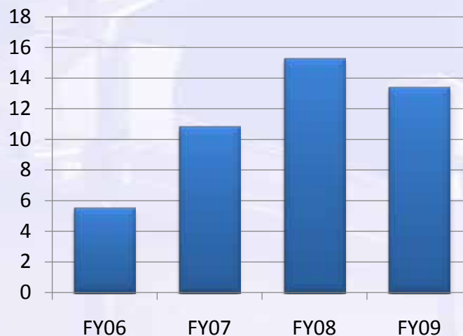
Net Profit Before Tax