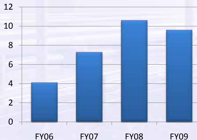
Net Profit After Tax